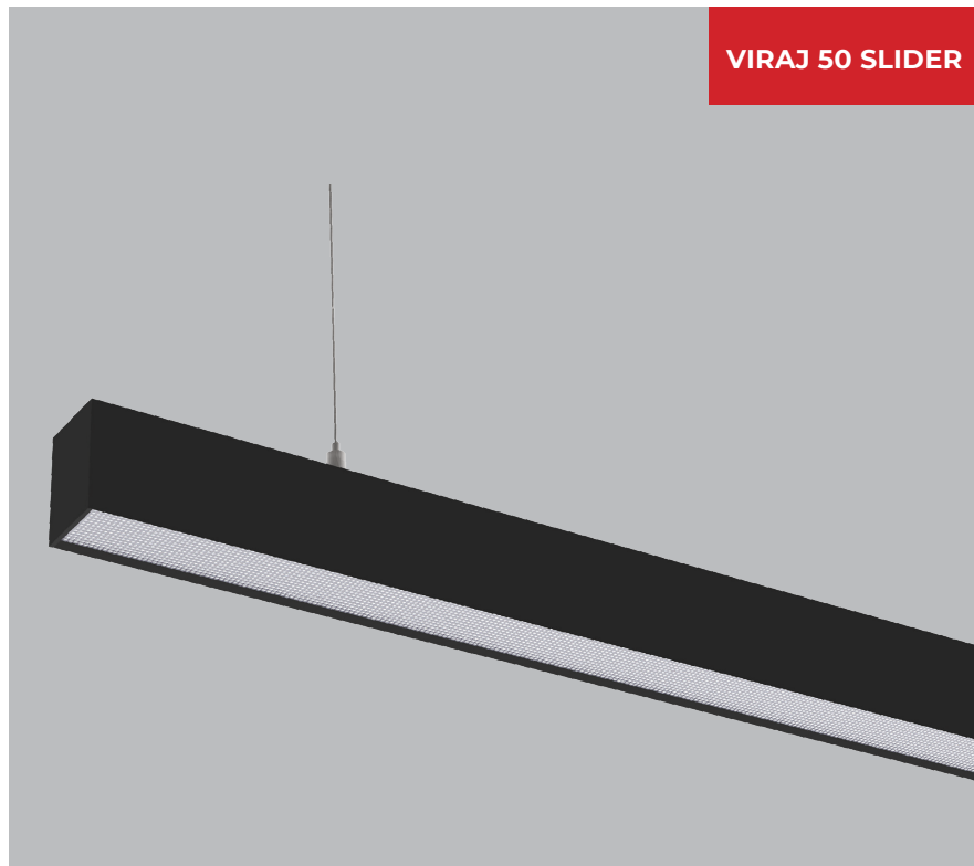
VIRAJ 50 SLIDER

VIRAJ 50 SLIDER Linear Luminaire in a sleek design with a slim Extruded aluminum housing and with premium powder coating finish.